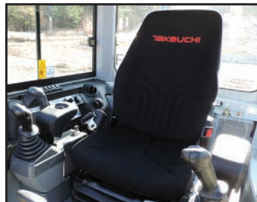
Deluxe High Back Suspension Seat