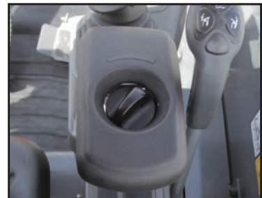
Electronic Throttle Control