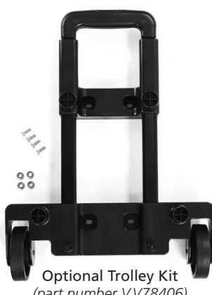
(part number VV78406)