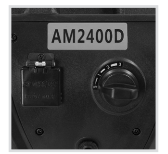
Three-speed fan with built-in power outlet.