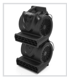
Stackable (up to 3) for easy storage.