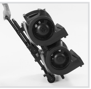
Optional trolley kit, with transport wheels and retractable handle.